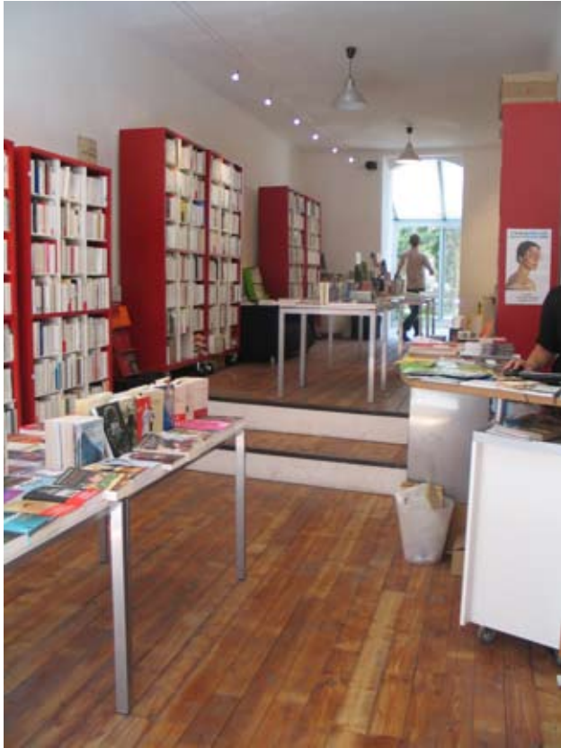
The interior space : 55 m 2