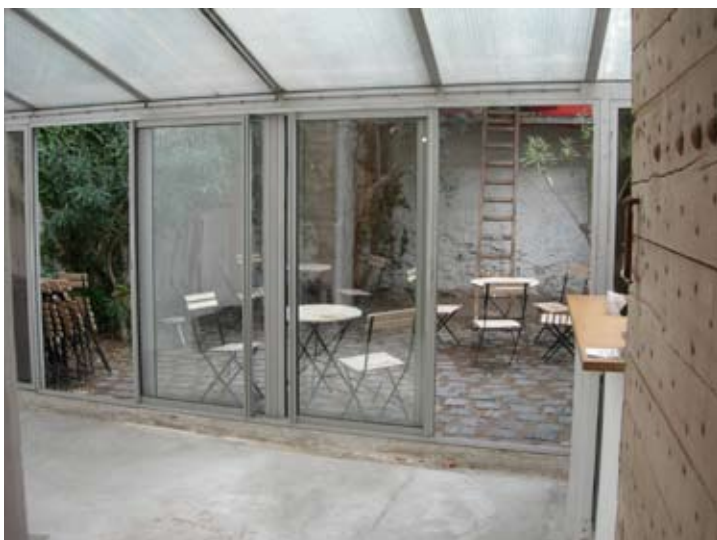
The terrace: 25m 2