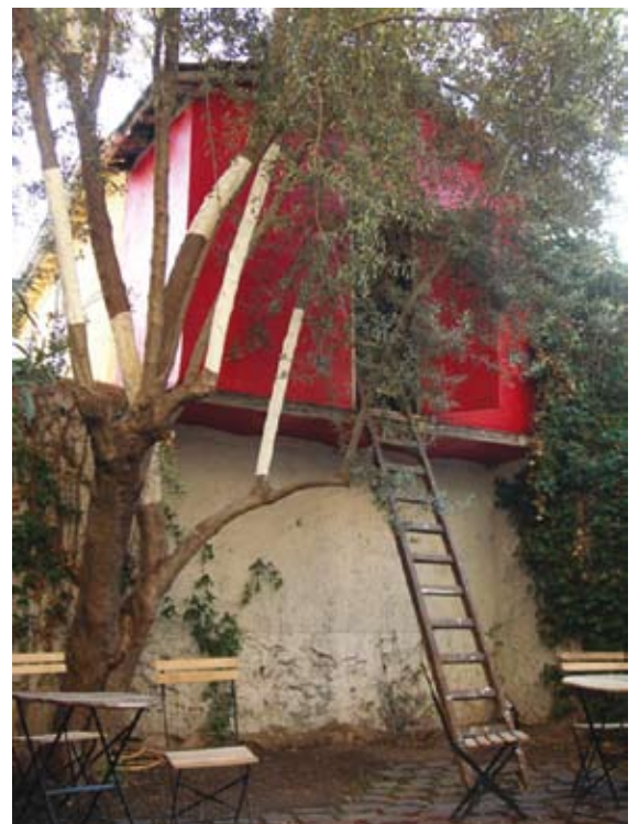
The garden (35 m 2 ) and the shed 5m 2